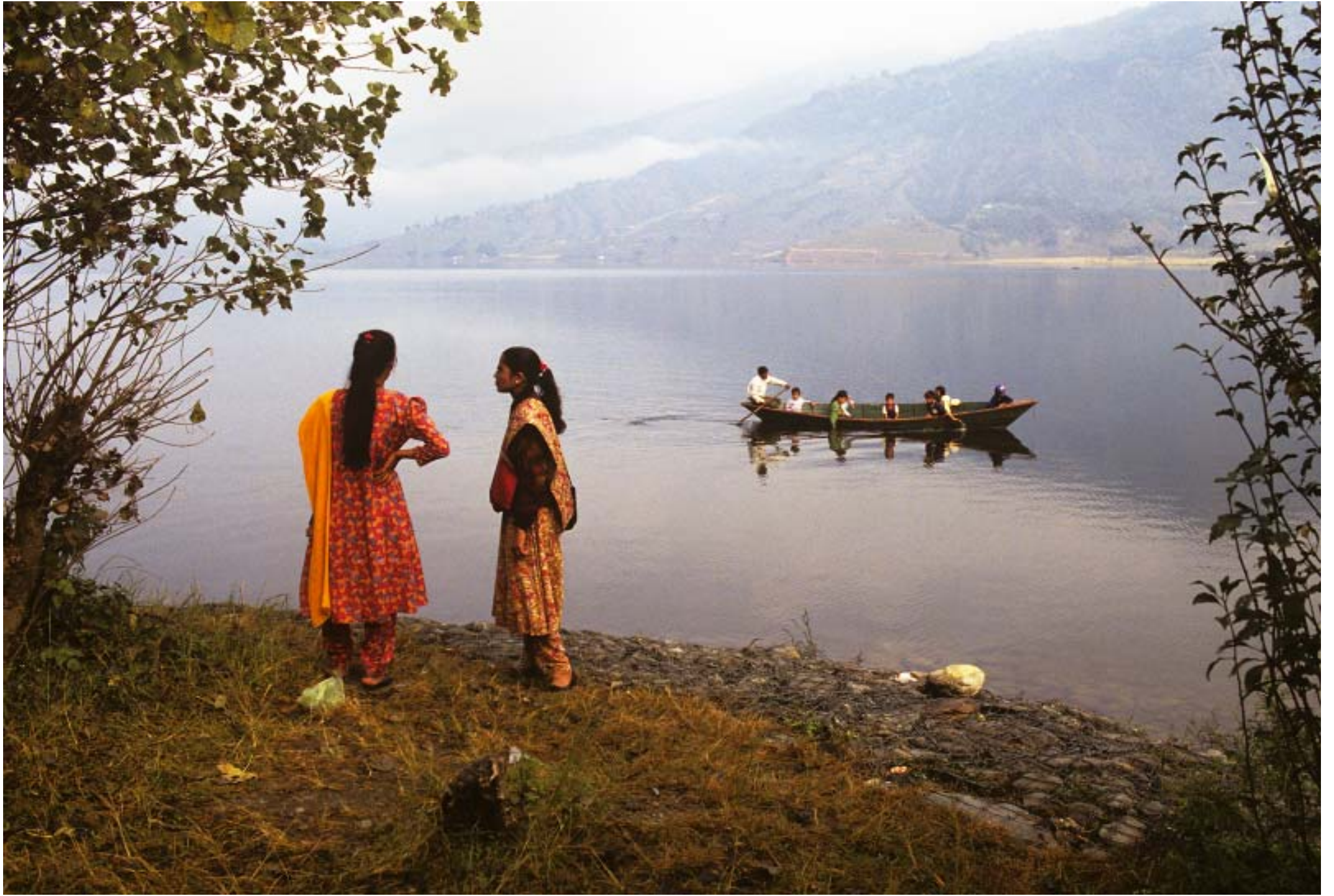
Phewa Tal, Pokhara